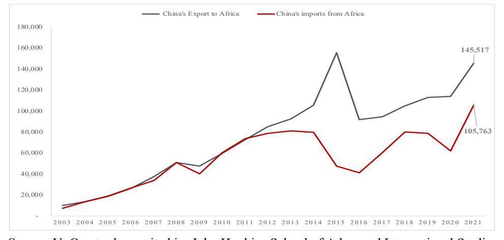
Figure 1. China's trade with Africa (USD million)

China is Africa's largest bilateral trading partner. Over the past 20 years, China-Africa two-way trade surged almost 22-fold. Following China's accession to the WTO in 2001, trade flows with Africa significantly increased thereafter and reached 251,3 billion USD in 2021. China's exports to Africa peaked in 2015, then decreased by over 40% the following year and have since recovered to reach 145,5 billion USD in 2021. Similarly, China's imports from Africa peaked in 2013. Merchandise trade with African countries decreased by over 40% by 2015 and grew to 105,8 billion USD in 2021, thus suggesting Africa's trade deficits with China. The annual growth rate of China's export to Africa for the past 20 years was 18,2% and the rate of imports stood at 20,78%. (Figure 1)